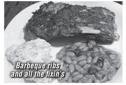
Barbeque ribs and all the fixin's

Donate today or purchase a meal ticket by calling Randy Fleming at 402-210-4885 or email auctioneer_32@msn.com