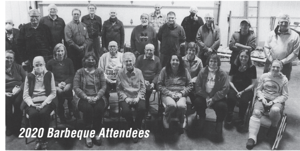
2020 Barbeque Attendees