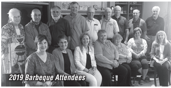
2019 Barbeque Attendees